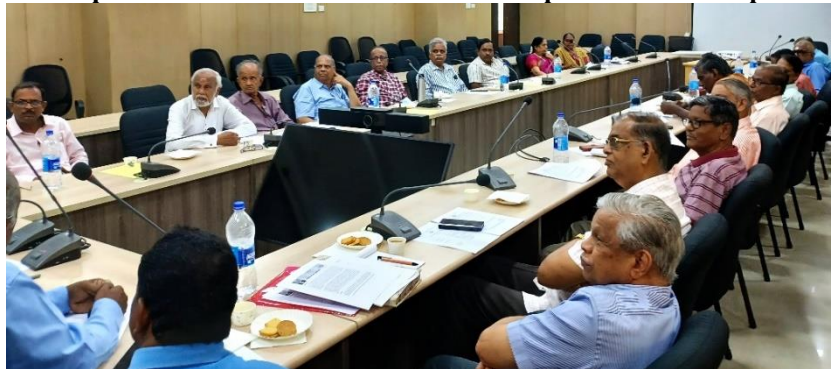
FTF members gathering