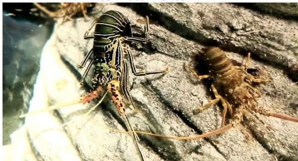
Marine palinurid lobsters